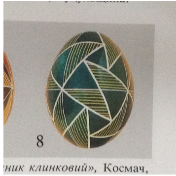
egg photo from Sixty Score of Easter Eggs by Zenon Elyjiw table 58